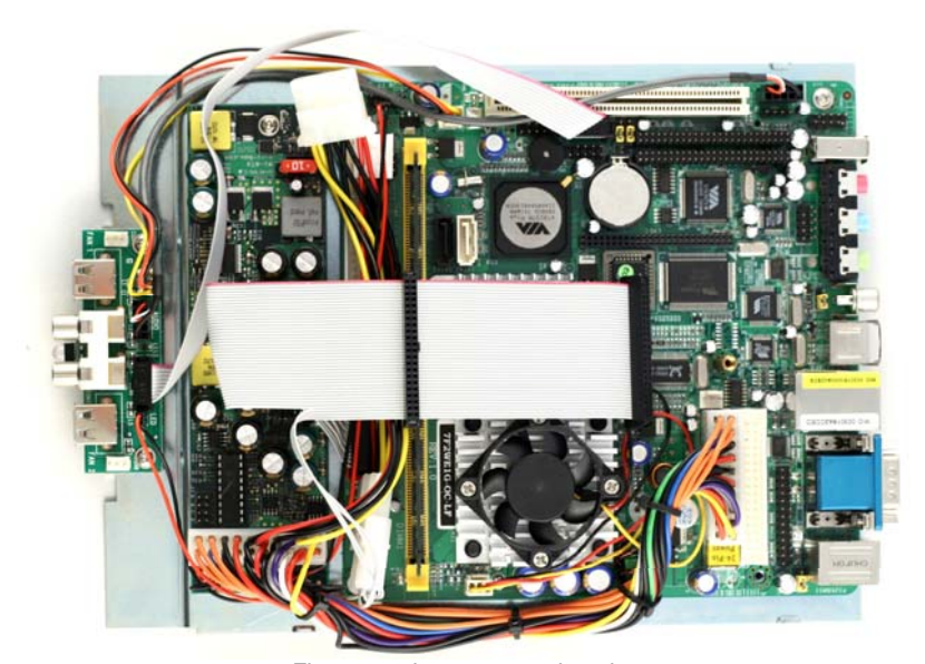
Figure 1.0, bottom mounting plate