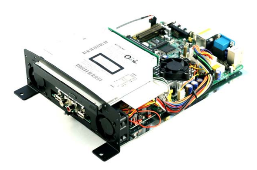
Figure 1.1, bottom mounting plate

9) Your final assembly should look similar to Figure 1.1. Slide the bottom plate into the extrusion and stop half way into the slide. Connect the power input faston wires to the Power Supply unit. (In case you are using a Power Amplifier, connect the AMP RMT wires to the Power Supply Anti-Thump header.